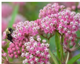
UP TO $200: ROSE MILKWEED

YOUR DONATIONS TOWARD OUR FLOWERS & FOUNDATIONS CAMPAIGN WILL HELP US REACH OUR GOAL AND SYMBOLICALLY ADD A NATIVE PLANT TO OUR SOUTH GARDEN! DONATIONS WILL BE ACKNOWLEDGED ON A GARDEN WALL OF GRATITUDE ON OUR WEBSITE.