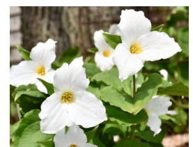
$1000 AND UP: TRILLIUM