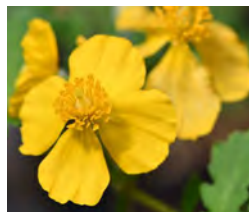
UP TO $500: WOODLAND POPPY