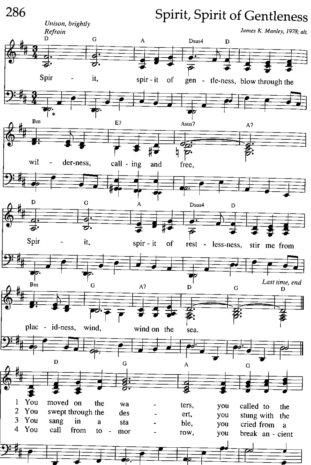
*Reduced-size notes may be played with organ pedals in lieu of or in combination with the other notes.