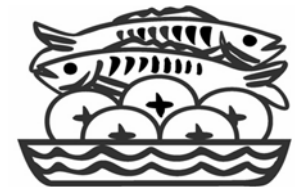
Loaves & Fishes

Loaves and Fishes Ministries has been a part of Haslett Community Church for approximately 20 years. The church provides the evening meal for the guests one day each month. There are four parts to the meal: a main course, a vegetable, a salad, and a dessert. The meal serves 15 people.