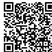
Distribution Day Sign Up