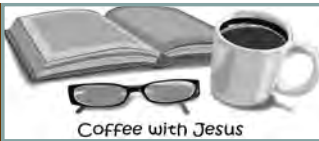
Coffee with Jesus

We meet on the third Tuesday each month. Please feel free to contact any of us with questions you might have. NEXT MEETING: Tuesday, June 21, @ 7:00pm in Fellowship Hall.