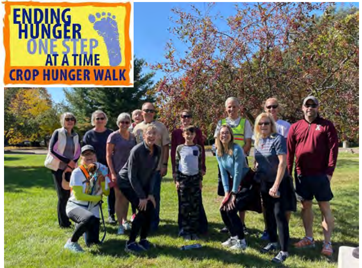
On October 9, a group of HCC friends walked/ran around Lake Lansing for the 2022 CROP Hunger Walk. Stay tuned for more info from our team in the December newsletter.