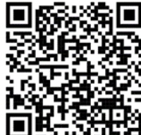
Distribution Day Sign Up